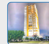
Kailash Hospital & Neuro Institute, Sector-71 Noida ☎ 0120- 2222222